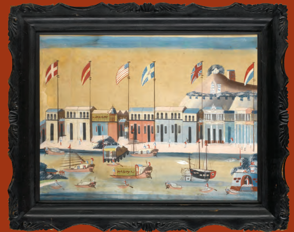
Chinese School, circa 1810

The Hong of Canton with the Dutch Folly Fort in the right foreground bodycolour 17 x 22 in. (43.5 x 57 cm.)