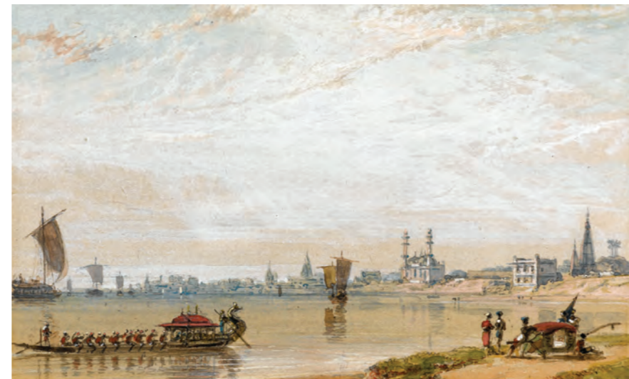
William Daniell, R.A. (1769-1837)

A view of Benares and the Mosque of Aurangzeb from the Ganges, with the state barge of the Maharajah in the foreground