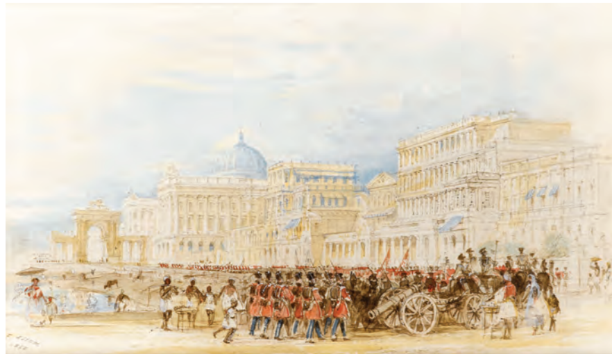
Thomas Allom, FRIBA (1804 – 1872)

A rare set of nine ornithological portraits, watercolour heightened with body colour and traces of gum Arabic, each on a crested card bearing the arms of arms of Man Singh II, Maharajah of Jaipur (1922-49) each 5 ¾ x 4 in. (15 x 10 cm.) a set of nine (9)