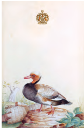
Company School, Calcutta, Early 19th Century, after Nicolas Robert (1614-1685)

A rare set of nine ornithological portraits, watercolour heightened with body colour and traces of gum Arabic, each on a crested card bearing the arms of arms of Man Singh II, Maharajah of Jaipur (1922-49) each 5 ¾ x 4 in. (15 x 10 cm.) a set of nine (9)