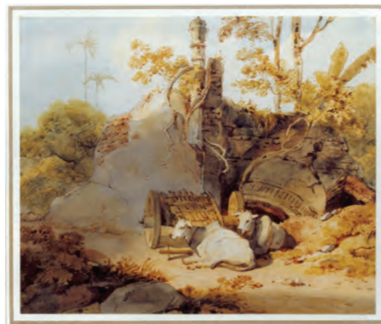
George Chinnery (1774-1852)